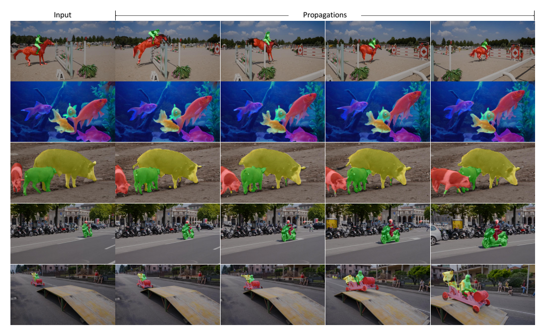
Figure 2: Instance mask propagation results.