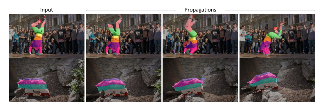
Figure 1: Texture Propagation.

In Figure 1, we show results of texture propagation. Following Wang et al. [2], we overlay a texture map on the object in the first video frame, then propagate this texture map across the rest of the video frames. As shown in Figure 1, our model is able to preserve the texture well during propagation, this indicates that our model is able to find precise correspondences between video frames.